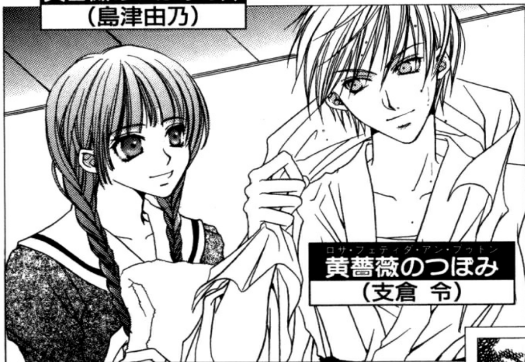
ロサ・フェティタ・アン・フットン 黄薔薇のつぼみ (支倉 令)